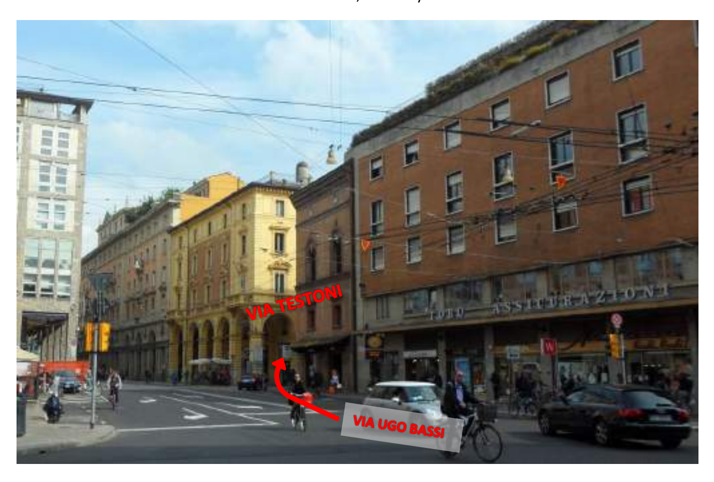
(signage indicating the hotels)

15 metres from the ENTRANCE on to VIA UGO BASSI, turn on your RIGHT on to VIA ALFREDO TESTONI