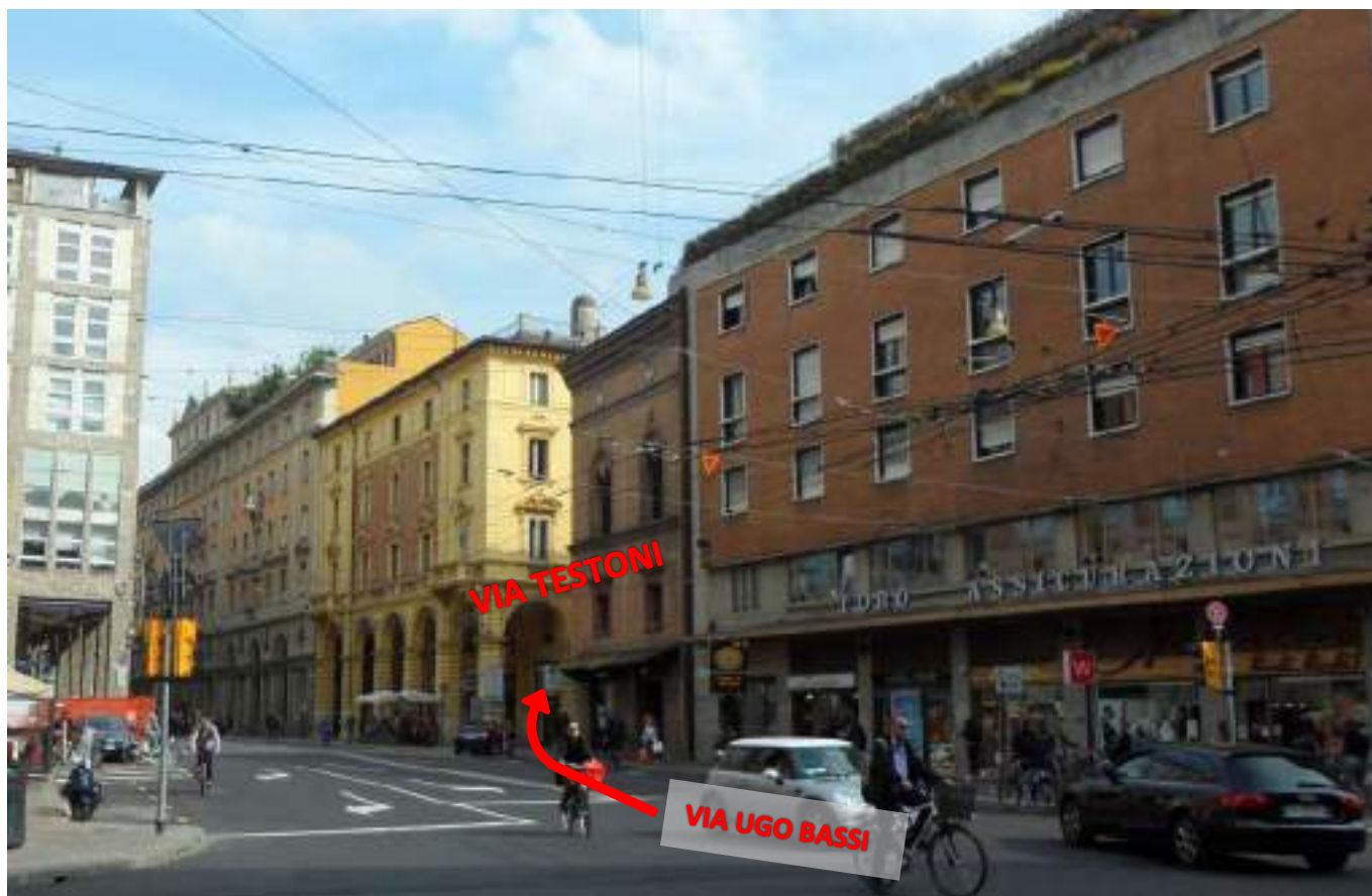
(signage indicating the hotels)